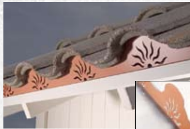
Vented Eave Riser

These components further reinforce our belief that we must strive to perfect not only a roof’s aesthetic form, but also its primary function. Only then can we expect to provide our customers with a roofing solution unmatched by any other roof company.