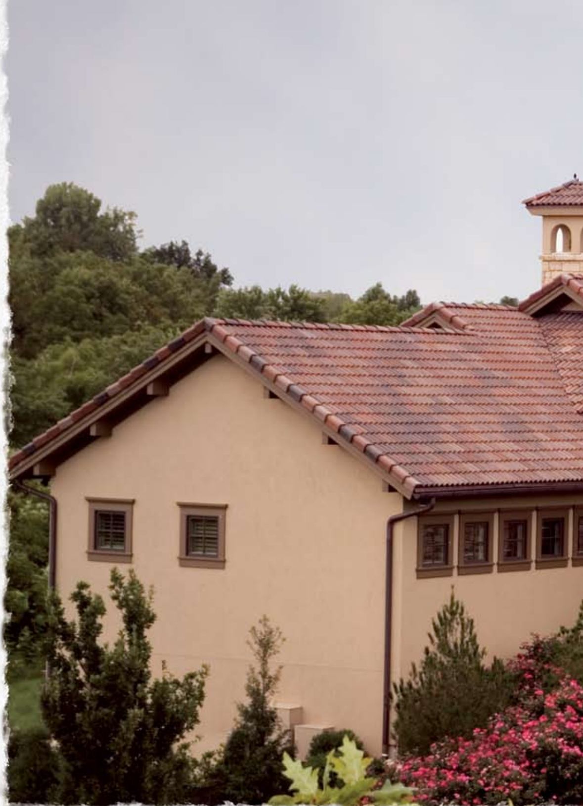
Plaza 47th Street Blend, Heartland Region

PHOENIX • ARIZONA GILROY • CALIFORNIA LATHROP • CALIFORNIA RIALTO • CALIFORNIA STOCKTON • CALIFORNIA DENVER • COLORADO BOCA RATON • FLORIDA POMPANO BEACH • FLORIDA LAKE WALES • FLORIDA ATLANTA • GEORGIA KAPOLEI • HAWAII KANSAS CITY • MISSOURI HENDERSON • NEVADA KATY • TEXAS TACOMA • WASHINGTON