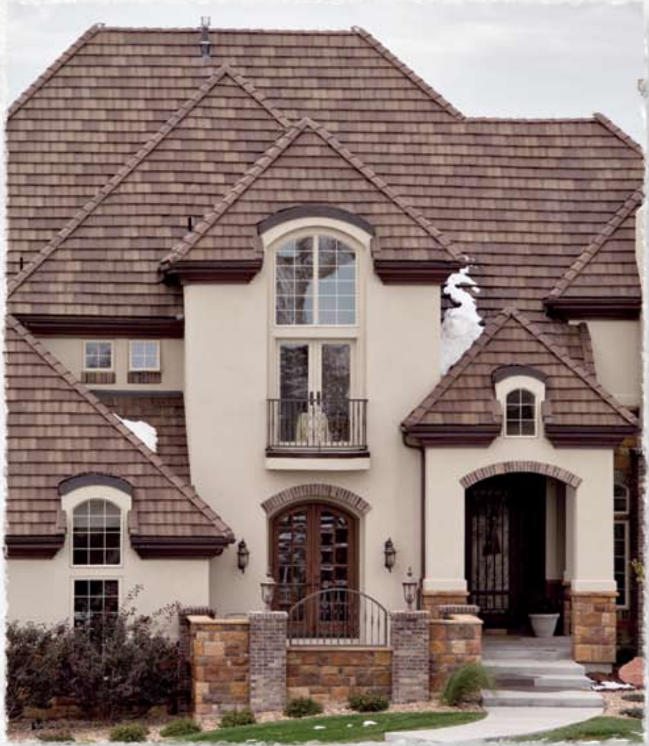
Slate Western Trail, Rocky Mountain Region