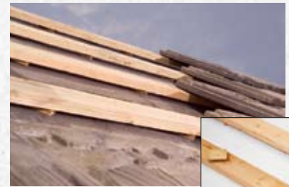
Elevated Batten System™